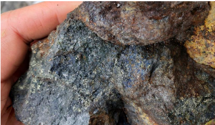
Figure 1: Photograph of 2022 grab sample D935096 collected from the Kim Skarn Target. Sample consists of massive magnetite-chalcopyrite skarn containing local azurite. D935096 graded 2.16% Cu, 109g/t Ag, 0.39g/t Au, and 0.16% Mo.

Assay results from 2022 channel sampling collected over a 17m length at the historic Kim Skarn Showing are pending.