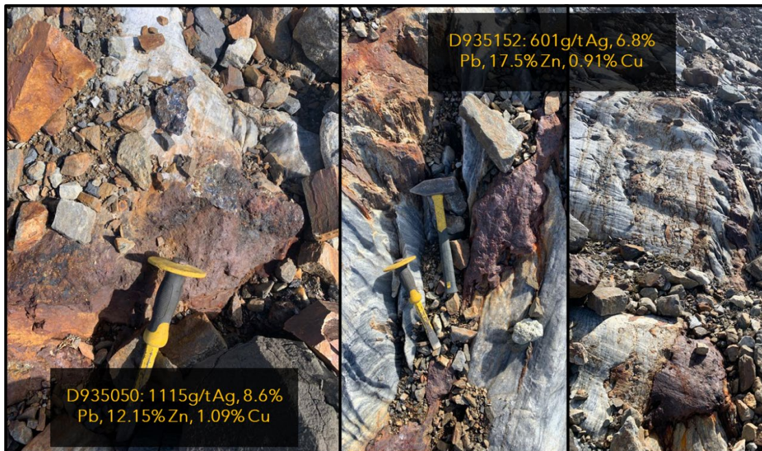
Figure 1: Photographs of high-grade massive and semi-massive carbonate replacement sulphide mineralization at the Gally CRD Target – Zone 2 (Core Assets, 2022).

Nick Rodway, President & CEO, commented: “The abundance of elevated surficial polymetallic discoveries at the Silver Lime Project continues to increase rapidly. The surface has barely been scratched at our district scale Blue Property, and our team is continuing to learn more about the geometry of the mineralized plumbing network and the limestone host rocks every day. We look forward to completing targeted drill testing at these new discoveries in 2023.”